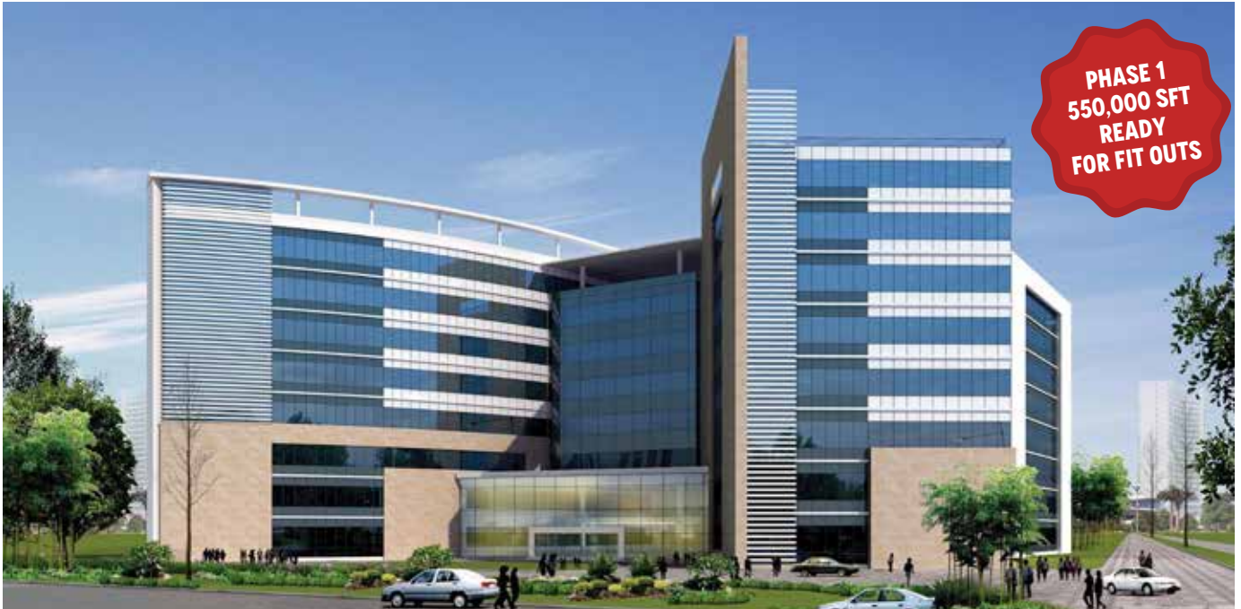
NSL Techzone IT SEZ, Noida